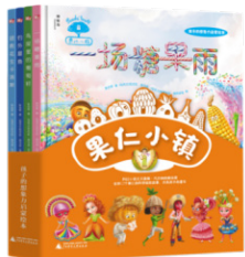
picture book/210*250 mm/40pp/Jan. 2019 rights sold: Sri Lanka (Sinhalese)