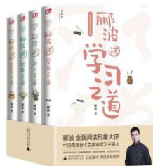
Chinese culture readings/148*210mm/192 pp/Sept. 2020 rights sold: world available

Traditional Chinese Wisdom by Li Bo is a series of books on interpreting traditional Chinese culture for young readers aged from 7 to 14 year-old. This series includes four topics, “manage your family”, “be socially connected”, “behave yourself” and “how to learn”, which are closely related to the growth of young people.