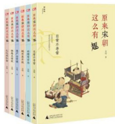
Chinese culture readings/170*240 mm/169pp/March. 2021 rights sold: worldwide available

This series of books is a historical set of the Song Dynasty created especially for children. The author starts from the details of paintings from this dynasty, combines with documentary records and references existing researches to show readers a lively Song Dynasty.