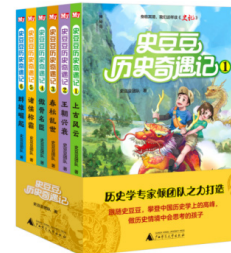
middle-grade fiction/148*210 mm/160pp/January, 2021 rights sold: worldwide available

This series narrates a historical-themed dream experienced by Doudou and Anqi, the two kids wearing high-tech “space-time helmets”, they time travelled and gone through the historical stories written in “The Records of the Grand Historian”, which is a monumental historical records of ancient China and the world finished around 94 BC.