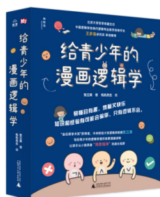
logic learning/170*200mm/36pp/Feb.2022 rights sold: world available

“Learn Logic in Cartoons” series book selects 10 basic concepts in logic and explains them in cartoons by volumes. Children can readily learn and master these seemingly boring concepts of philosophy and logic in cartoons, enhancing the logical expression and self-cognition ability of teenagers, and helping them shape a positive world outlook in their future development.