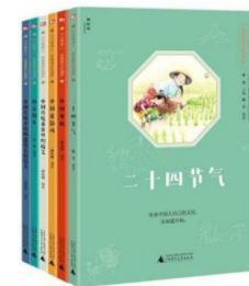
Chinese culture readings/185*255 mm/140pp/February. 2021 rights sold: world available

The series incorporates 6 representative Chinese items carefully selected from the UNESCO’s Representative List of Intangible Cultural Heritage of Humanity. Through introducing their development history, telling stories of cultural inheritance and explaining cultural connotation, the writers show the unique, charming humanity and the cultural value of these intangible cultural heritage to children, hoping not only let them know, but also fall in love with the Chinese Intangible Cultural Heritage of Humanity.