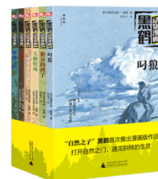
commic stories/148*210 mm/120pp/Jan. 2020 rights sold: Sri Lanka (Sinhalese)

This is the first comics series of Gerelchimeg Blackcrane, one of animal fiction masters in China. This series was adapted from his original best-selling animal fiction, recreated with vivid illustrations. Heroes of his works are strongly characterized, just like the survivors and warriors of Erin Hunter. Imagine them on vast snow, grassland, desert, high mountains, primeval forest, go grazing, hunting! Isn’t this nomadic civilization the code of nature?