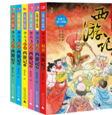
classic retellings/148*210 mm/160pp/Apr. 2020 rights sold: world available

This is a simplified but funny version of the famous Chinese classics Journey to the West. The young readers will understand the masterpiece in a direct way.