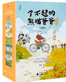
middle-grade fiction/148*210 mm/128 pp/May, 2019 rights sold: world available

This series is about fantasy experiences of Panda Daddy and his family. There was a red lucky mark on Panda Daddy’s forehead, but he was not embraced by fortune at all. He was always faced with situations, sometimes tough enough to shake him off to the ground, sometimes warming and touching: making a living in a imagined city, being sucked into a chessboard world upside down, planting meaningful stories to share with whoever did wrong etc.