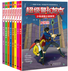
middle-grade fiction/148*210 mm/ 128-160pp/Jan. 2019 rights sold: worldwide available

This is a remarkable detective story series, including a lot of thrilling plots hitting both adult and young readers.